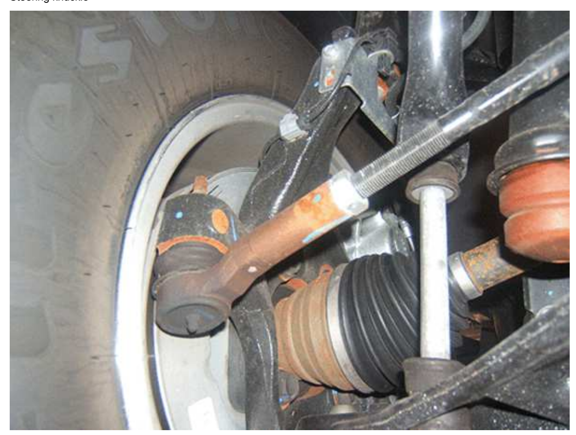
Tie rod end