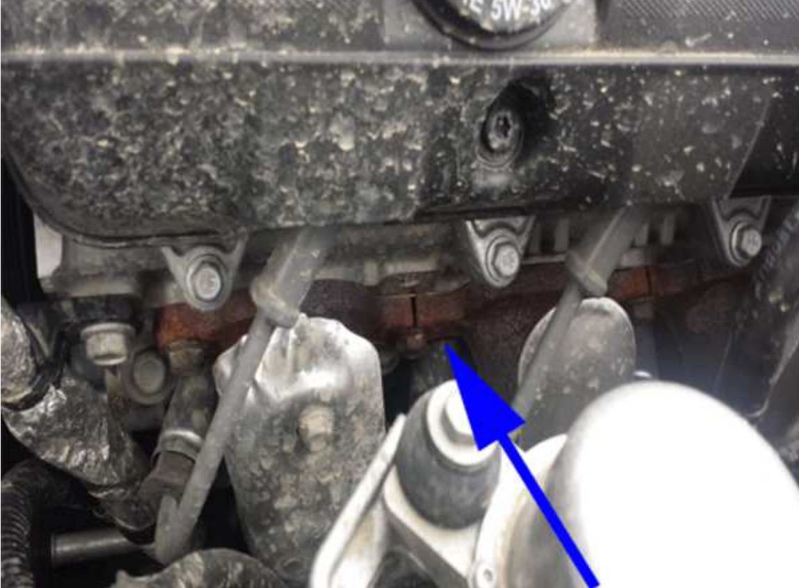
Exhaust system components

Note: During transit between the plant and the dealer, some of the exhaust system components may corrode as a result of salt exposure. These exhaust parts are made of a bare mild-grade stainless steel that will oxidize, or appear rusty. Over time, these components will have a uniform rust-like discoloration, which should be considered a normal condition.