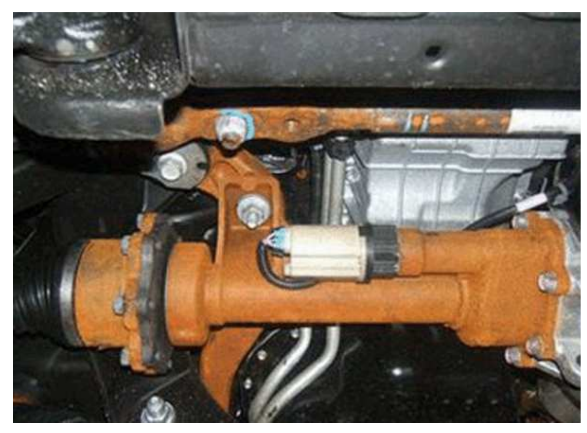
Front axle housing