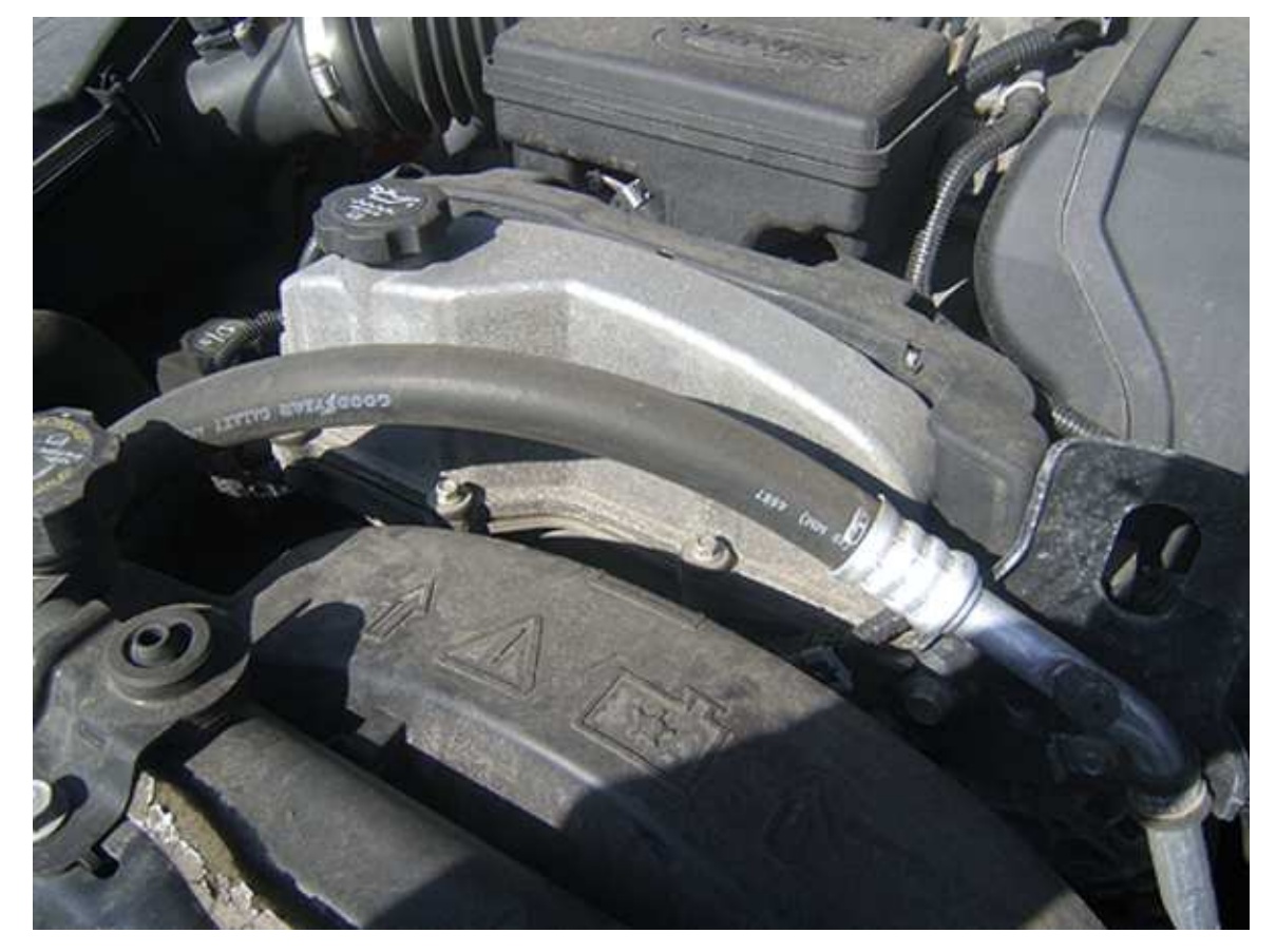
Under hood components