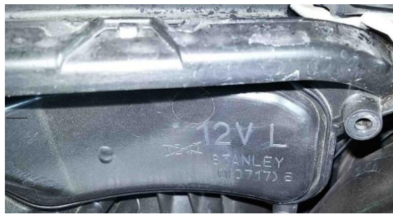
“STANLEY” lettering on the back side.