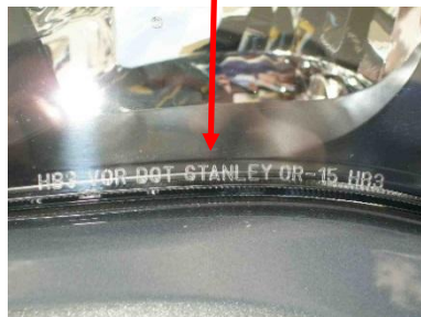
“STANLEY” lettering on the front lens.