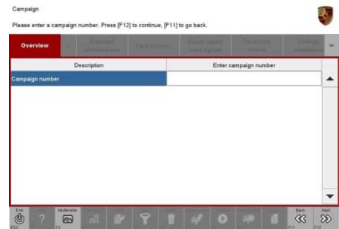
Programming number input field