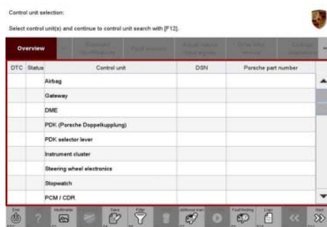
Control unit selection