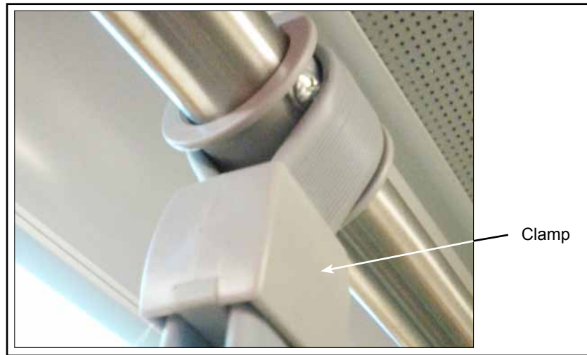
Figure 1 - Grab Handle With a Plastic Clamp (Usual Model N60748)