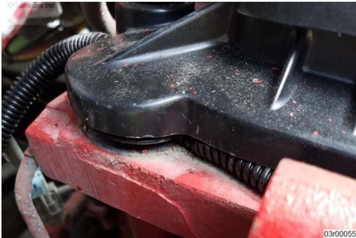
Figure 1, Example of Pinched Wiring Harness.