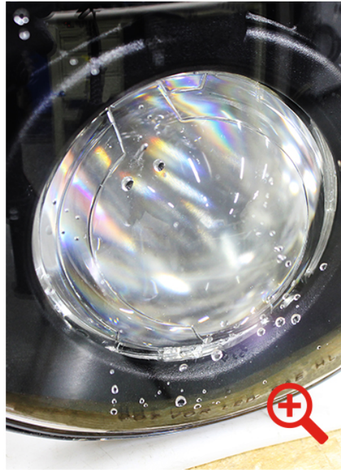
Small Water Droplets