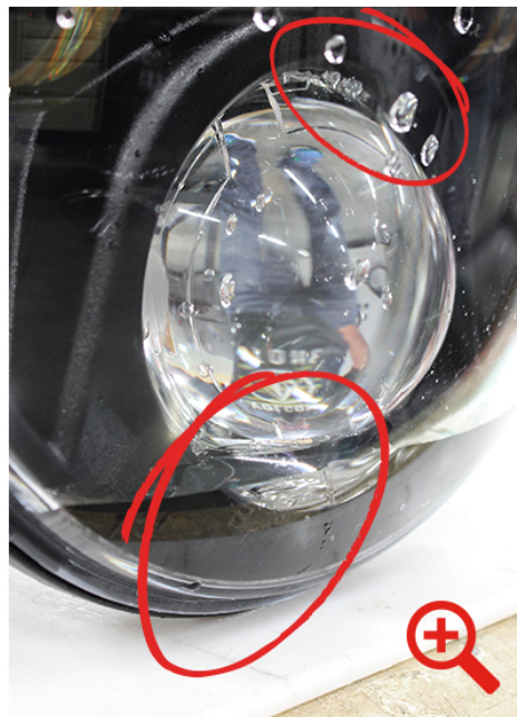
Large Droplets & Pooled Water