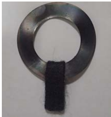
NEW Wave Washer

The 3 “tang” seen on the inside of the OLD wave washer have been deleted. The inside diameter of the NEW wave washer has been decreased and a small felt added to allow the washer to turn smoother with the buckle and have a better fit on the shoulder portion of the retaining bolt.