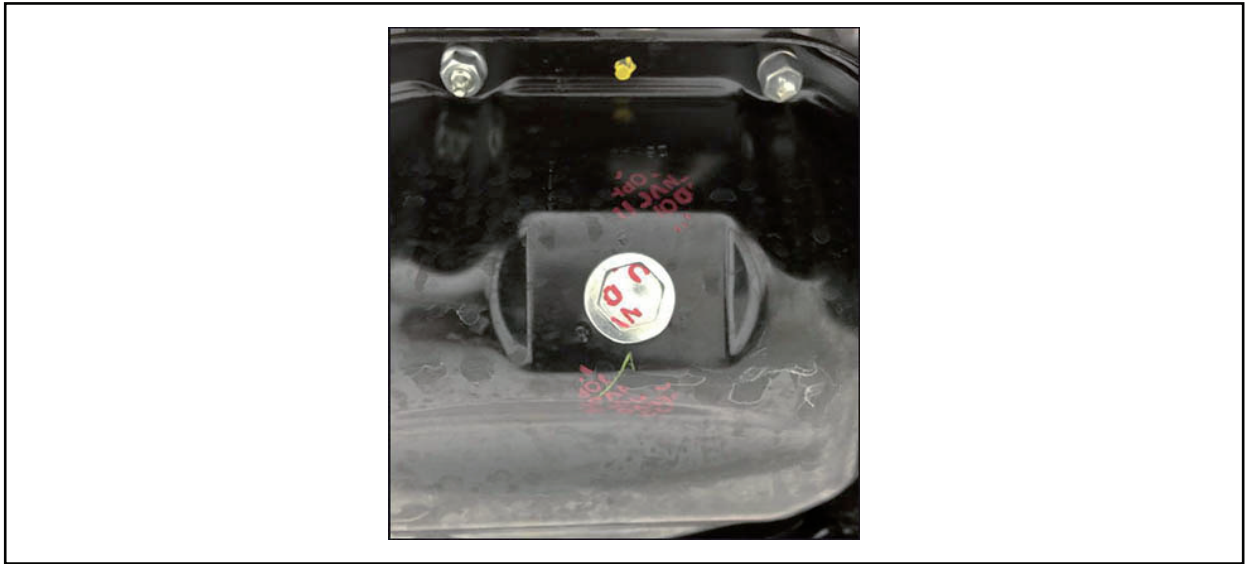
Figure 2. Indication of Inspection Label Removal