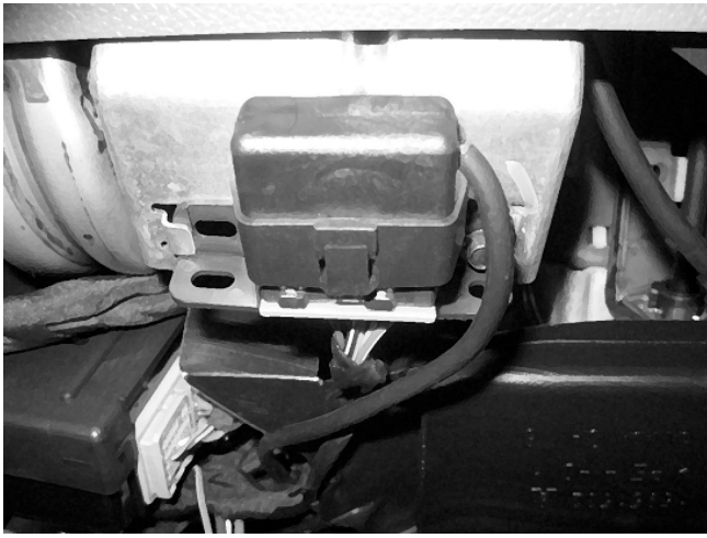
Aftermarket Device Switch