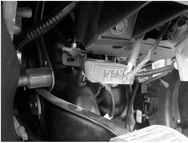
Fleet Tracking Module Plugged Into the DLC