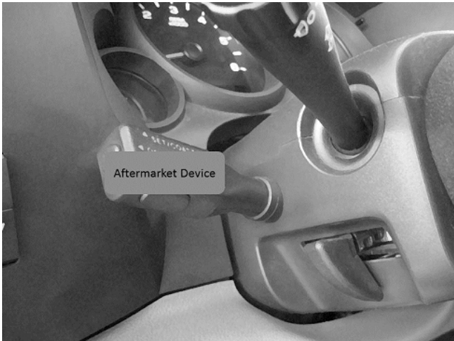
Monitoring Device Example