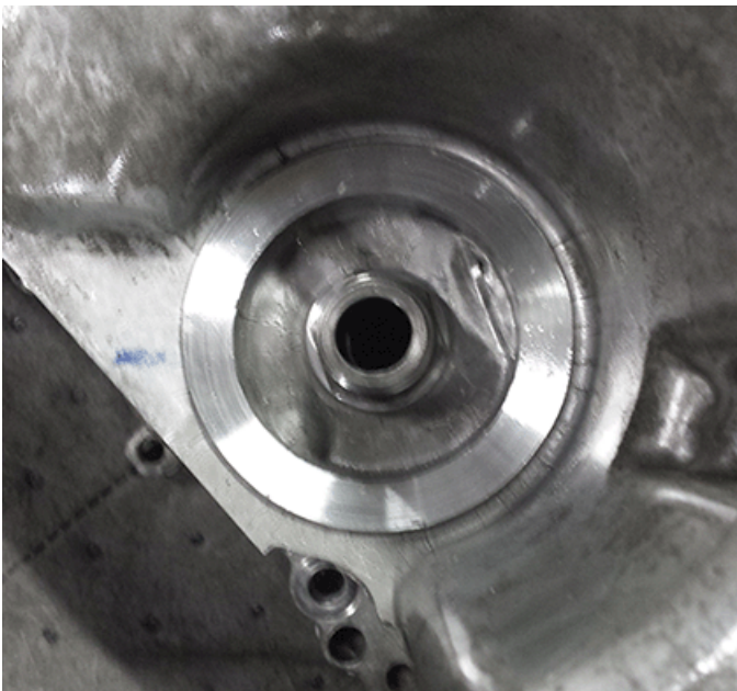
This is an oil pan with the cast over passage

If this concern occurs, remove the oil filter and inspect for a cast over passage, (See illustration's below)