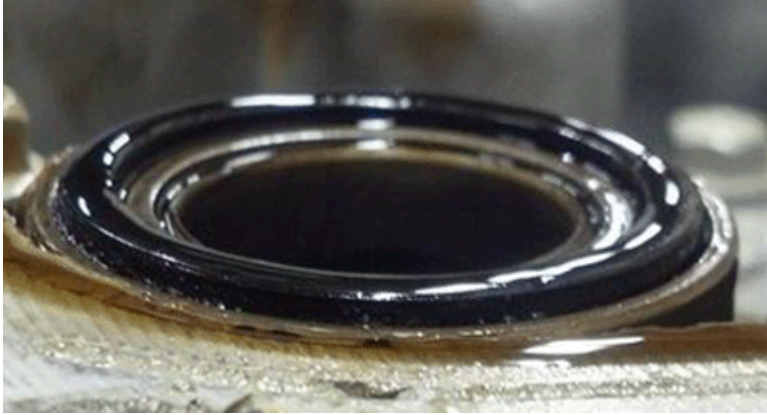
This is an example of a new seal