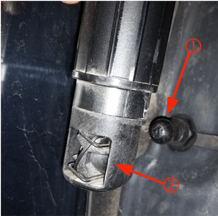
- Below are examples of ball socket clips with properly orientated and seated ball socket clips (1 & 2).