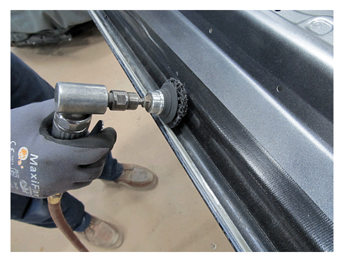
If sand blasting is not available, remove the rust using a 3-M Scotch-Brite™Clean and Strip Disc, Part # 07466, abrasive wheel.