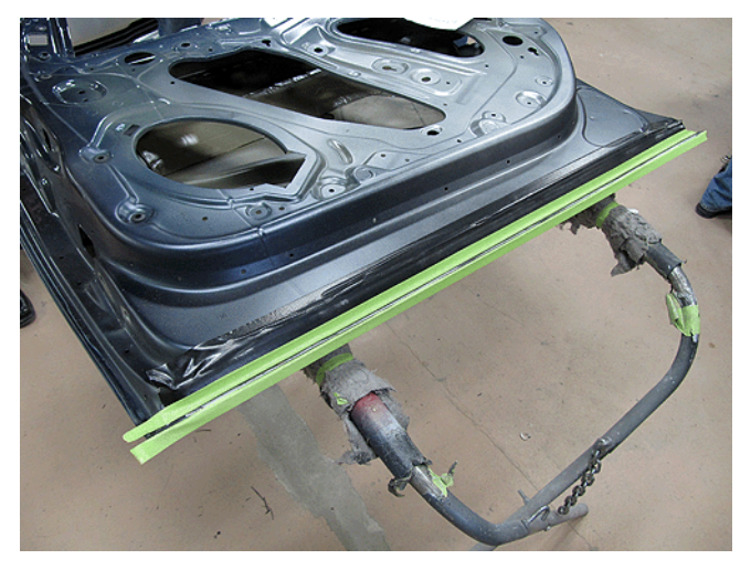
15. Mask the area as shown to create a 10 mm (0.40 in) wide sealer area.