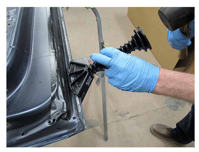
14. Close the hem flange using the flange closing tool.