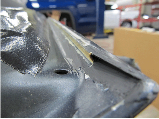
13. Using a squeegee, force the sealer into the open joint area.