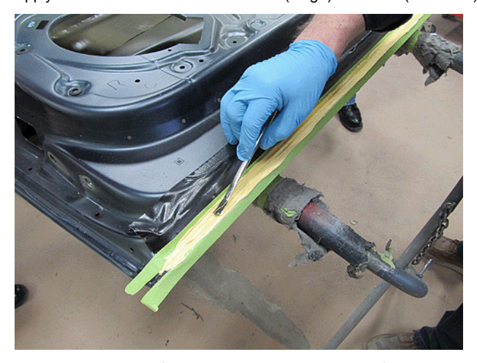
Use a small brush to finish the area, the sealer will self level to remove any brush marks.