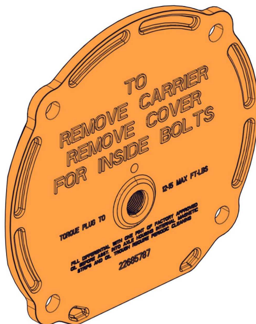
Fig. 2 New Style Fill Plug and Face-Mounted O-Ring Shown