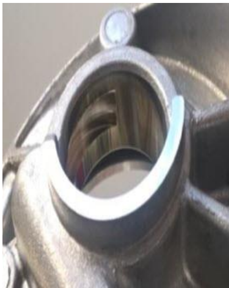
Figure 2. Original Part 06H 103 144 J .