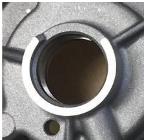
Figure 3. Improved Part 06H 103 144 K