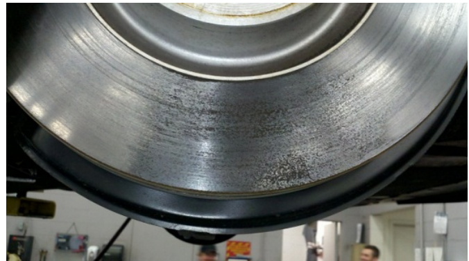
Figure 5. Brake pad material has transferred to the discs.