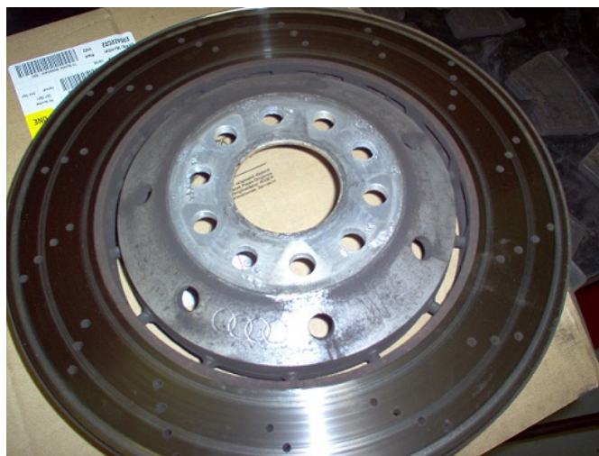
Figure 2. Grooved disc.