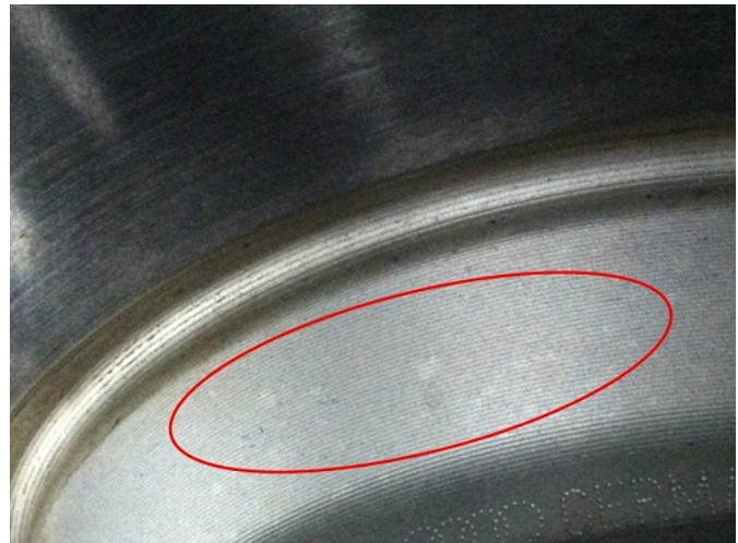
Figure 4. Small spots and discoloration due to chemical contamination from cleaner that was sprayed directly onto the disc.