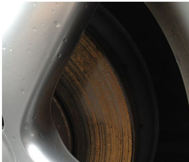
Figure 1. Disc covered with rust.