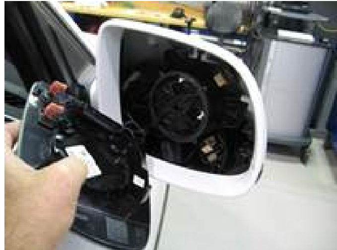
Figure 1. Exterior rear view mirror glass removed.