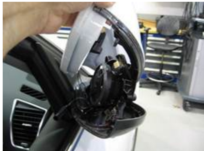
Figure 4. Removing the mirror cover.