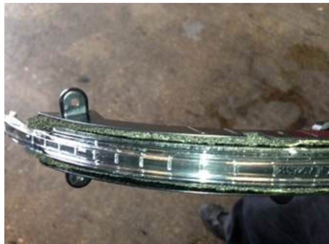
Figure 8. Turn signal lamp with sealing foam tape installed.