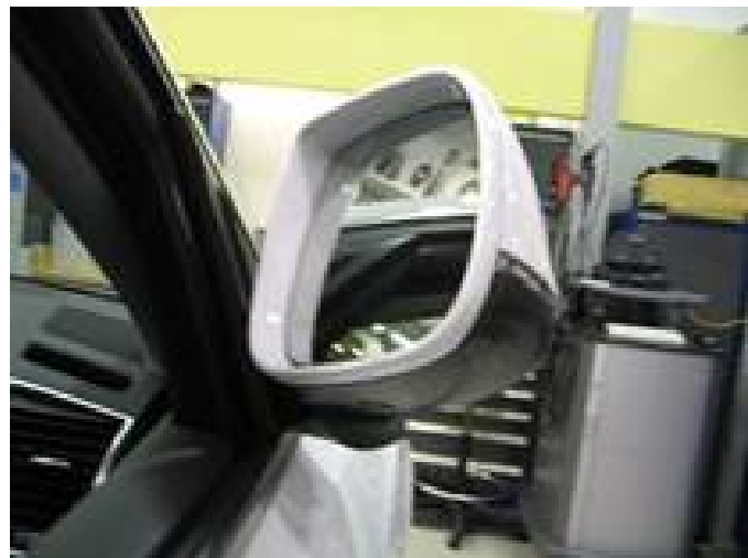
Figure 2. Exterior rear view mirror manually folded.