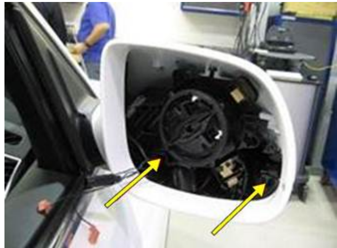
Figure 3. Location of the retaining clips.