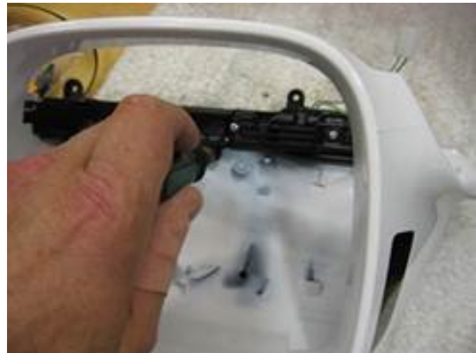
Figure 7. Removing the turn signal lamp.