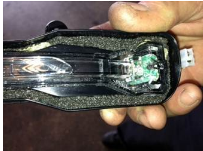
Figure 9. Turn signal lamp with sealing foam tape installed.