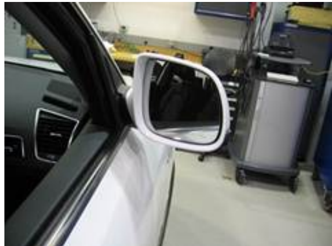
Figure 10. Mirror reassembled.

Tip: Exercise care in the reassembly process. Incorrect or incomplete reassembly will cause recurrence or additional wind noise from the mirror assembly.