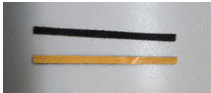
Figure 5. Strips cut from felt tape.