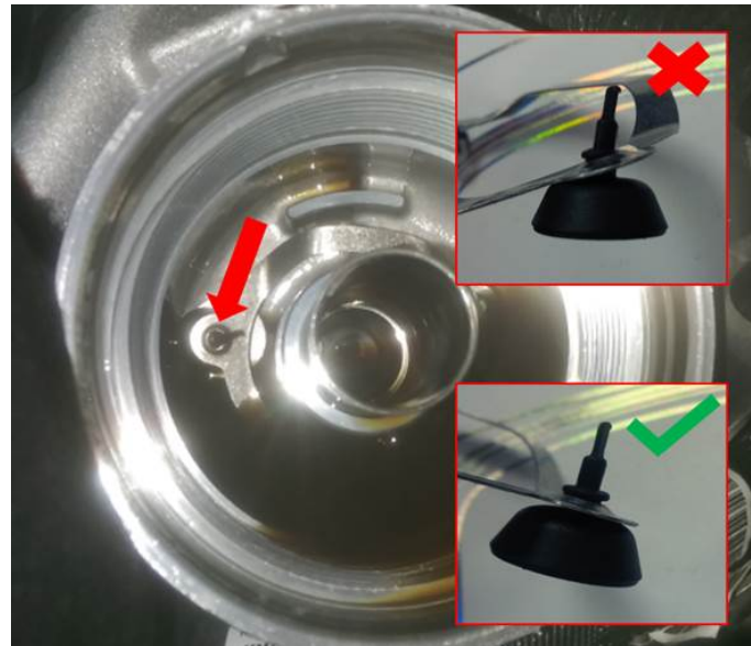
Figure 1. Correct and incorrect position of the oil drain plug.

If the condition persists, contact the Technical Assistance Center (TAC).