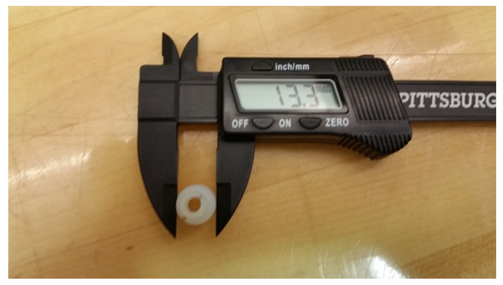
Figure 3 (Acceptable diameter after adding adhesive strip)

• Measure the diameter of the new plug with the adhesive strip. The diameter must be approximately 13.4 mm (see Fig. 3).