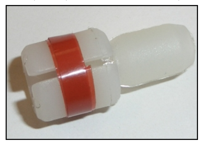
Figure 2 (Adhesive strip shown in red for clarity)