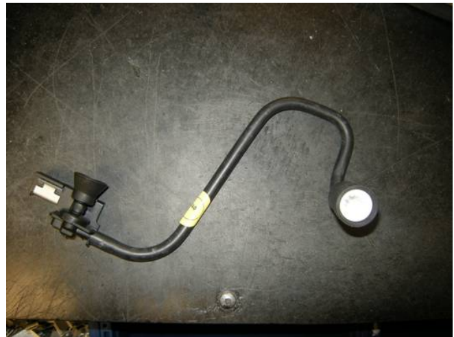
Figure 2. Revised ventilation hose.