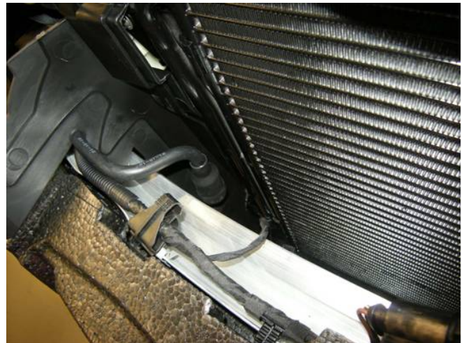
Figure 3. Filter element hanging freely behind cross-member.