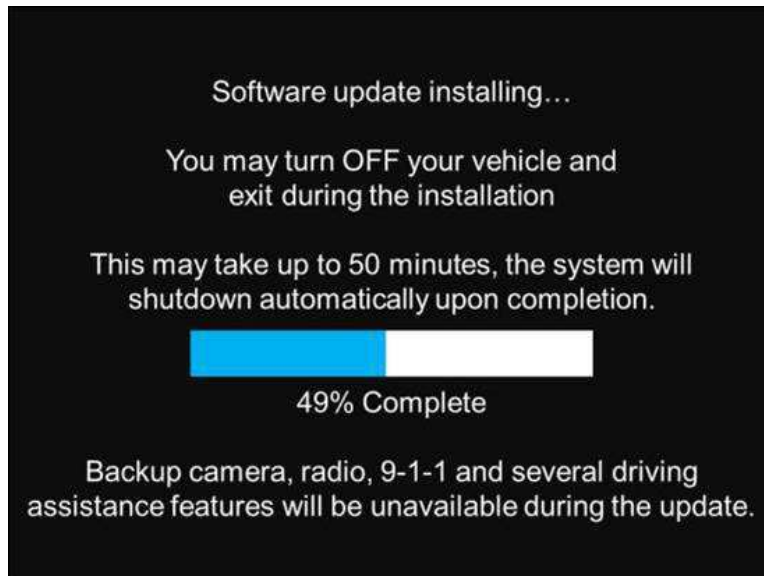
Fig. 4 Second Phase

NOTE: The second phase may take up to 50 minutes to complete.