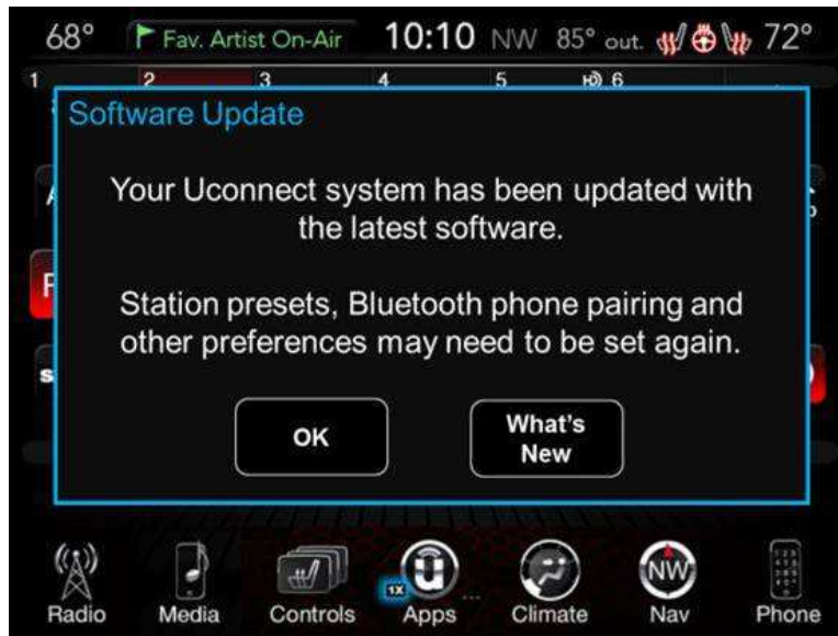
Fig. 5 Confirmation Screen

NOTE: If there are other hardware issues or concerns, contact the STAR Center for support.