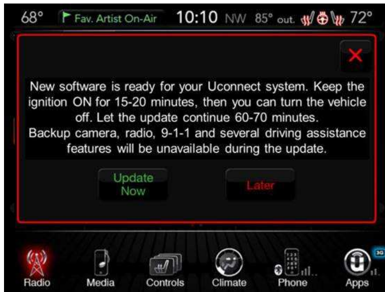
Fig. 1 Software Acceptance Screen