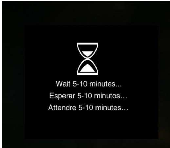
Fig. 3 Wait Screen

3. The “wait” screen (Fig. 3) will appear multiple times during the update.