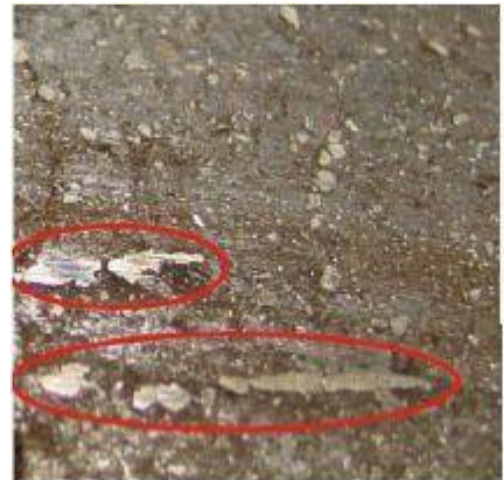
Figure 1. Metallic deposits.