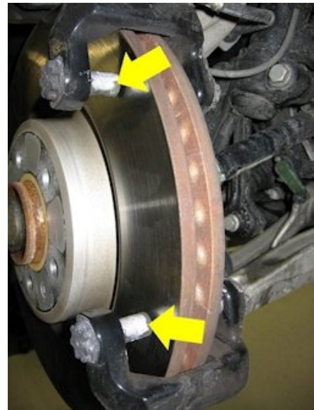
Figure 5. Caliper carrier guide pins with anti-seize ( G 052560A2 ) lubricant applied where the pads make contact.