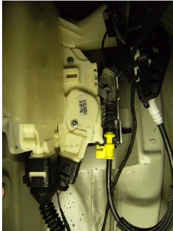
Figure 1. Bowden cable routing.

When fitting the Bowden cable from the mounting bar to the door lock the cable can get kinked. In some cases this can increase the inner friction of the strand in the Bowden cable. As a result, the door lock stays in pressed position or does not completely return to its zero position. (Figure 1).