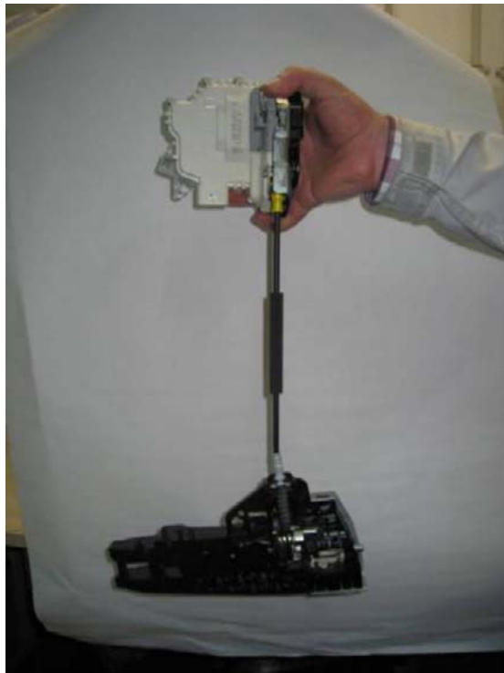
Figure 5. Do not turn the lock or the mounting bar.