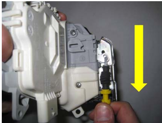
Figure 4. Pulling down the Bowden cable.

Slot in the yellow locking mechanism to the left