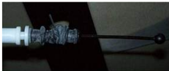
Figure 2. Distorted rubber grommets.

When the Bowden cable gets twisted during the installation the rubber grommets can get distorted. Consequently, the Bowden cable has a too high inner friction and the door lock does not move to the zero position. (Figure 2).