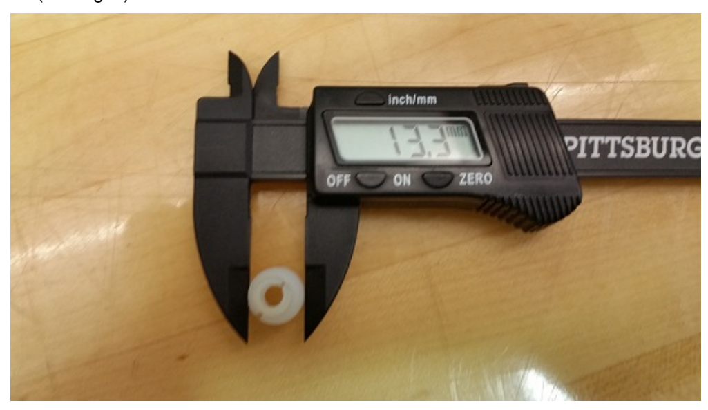
Figure 3 (Acceptable diameter after adding adhesive strip)

Measure the diameter of the new plug with the adhesive strip. The diameter must be approximately 13.4 mm (see Fig. 3).