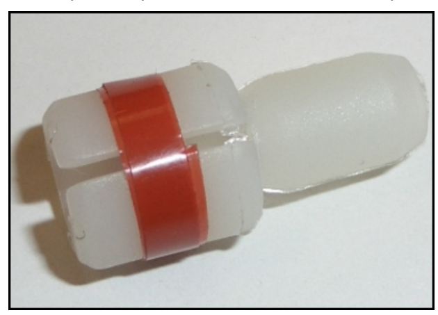
Figure 2 (Adhesive strip shown in red for clarity)