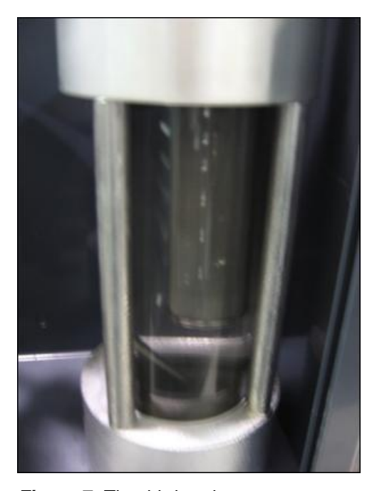
Figure 7. The third cycle.

• The debris is then rinsed from the circuit and contained within the filtration in the flusher. After the flush program, the system will be evacuated.