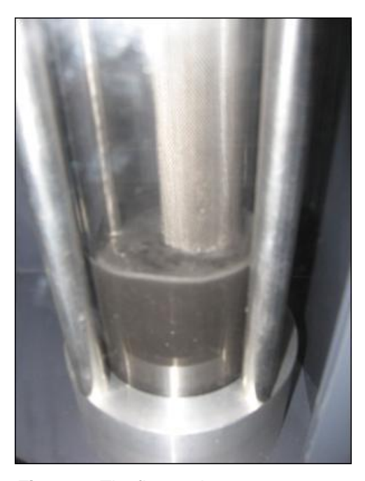
Figure 5. The first cycle.

The flush program will begin with an evacuation of the system and a rate of rise test. This is necessary to test the integrity of the connections before the flush cycles begin. If the rate of rise test passes, the program will proceed into the flush cycles. (Figures 5 – 7). These cycles will occur automatically in succession.