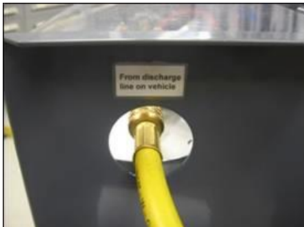
Figure 2. A flushing attachment port.

This connection strategy allows for a system flush in the opposite direction of the normal refrigerant flow (Figure 4).