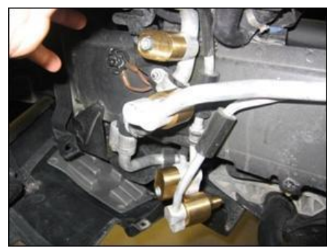
1. Separate the front and rear air conditioning systems for individual rinse operations.

For Touareg with four zone climate control, the flush process will be repeated for the additional air conditioning unit (rear of vehicle) according to the repair information in Elsa.