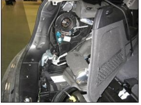
Figure 9. Location of rear air conditioning unit and expansion valve.