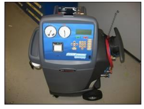
Figure 1. The ROB134APF Air Conditioning Service System with VAS 6337/1A Air Conditioning System Flushing Device.