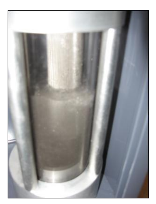
Figure 6. The second cycle.