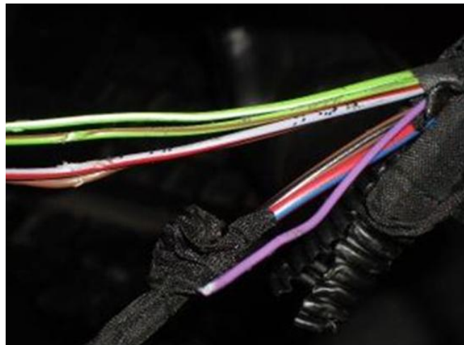
Figure 2. Wire harness under driver's side headlight.

The second known section is in the wire harness located under the driver's side headlight (Figure 2).