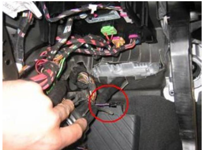
Figure 1. Wire harness in driver footwell area.

There are two known sections in the wiring harness that can be affected, but the potentially affected areas are not limited to these two known sections. One of the known sections is in the driver's footwell area where the wire harness enters the interior of the car from the engine bay (Figure 1).