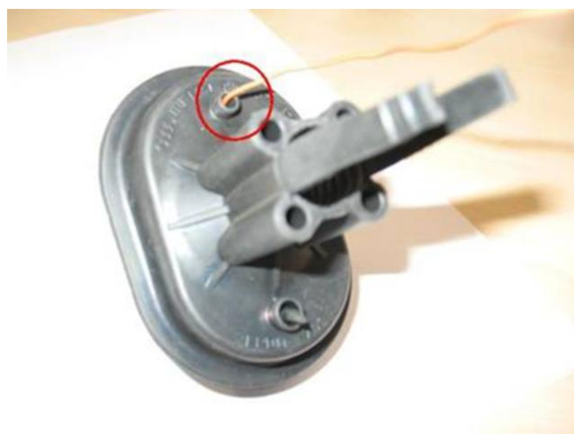
Figure 4. Access hole in grommet.