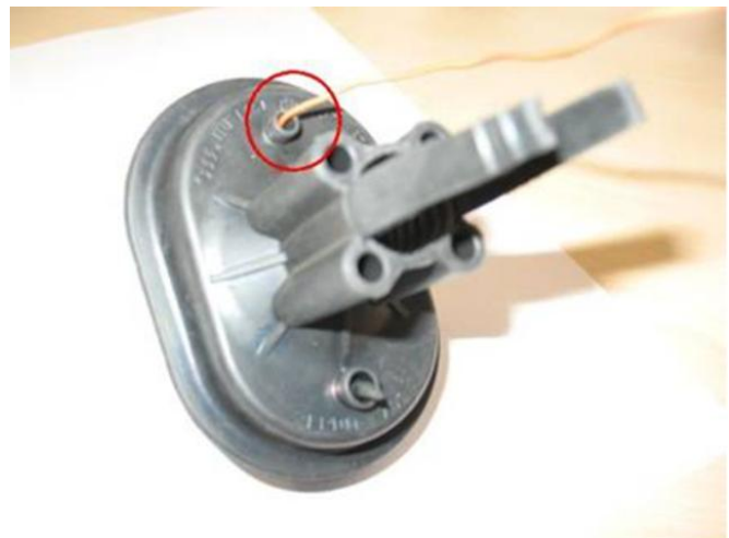
Figure 6. Access hole in grommet to be sealed with Butyl sealant.