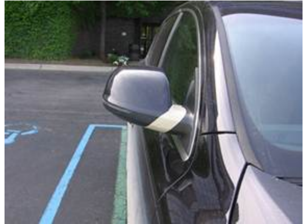
Figure 1. Tape applied to rotation collar seam.