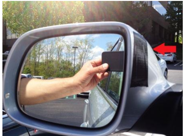
Figure 2. Tape applied over the lane change assist lens.