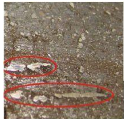
Figure 1. Metallic deposits.