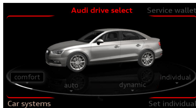
Figure 1. Audi drive select functions unavailable and greyed-out.