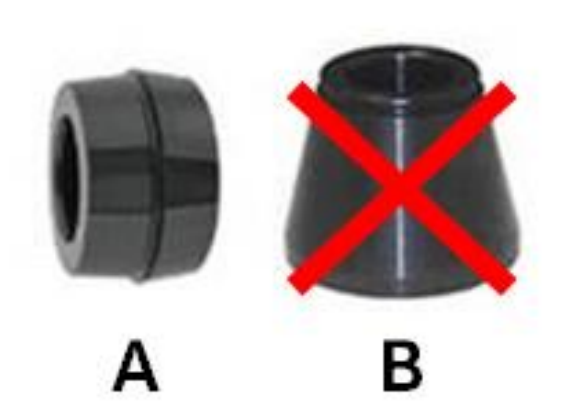
Figure 3. Example of a collet (A) vs. a centering cone (B).

An incorrect style of clamp could damage the wheel (Figure 4, C).