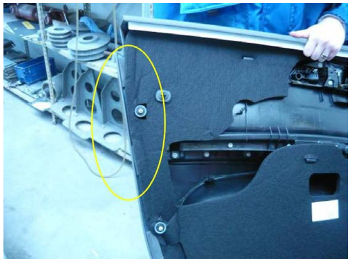
Figure 2. Insulation mat properly installed.