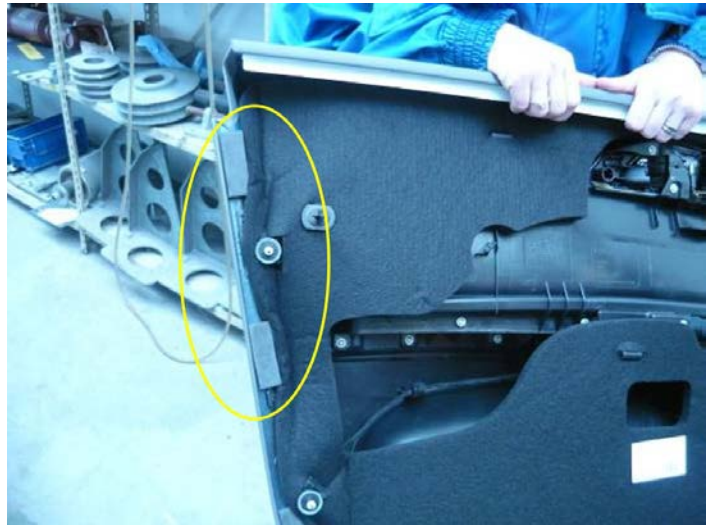
Figure 1. Insulation mat installed around the foam pads.