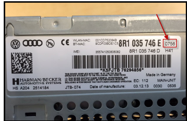
Figure 3. Main unit part label.