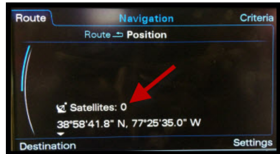
Figure 1. No satellite reception.