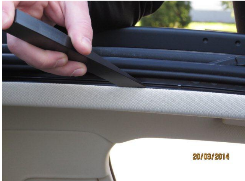
Figure 1: Unclipping the sunroof cover trim frame.