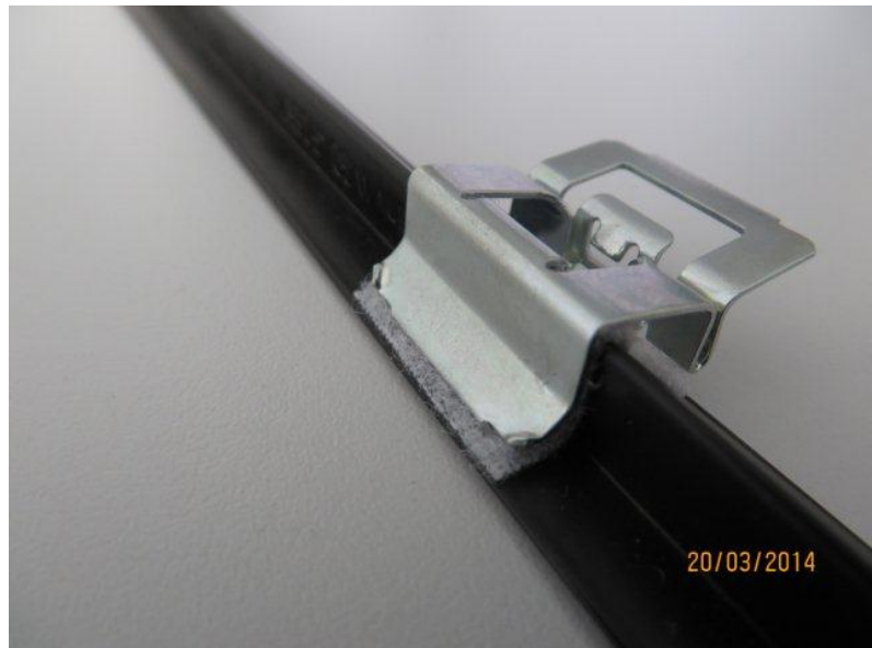
Figure 4: Retaining clip isolated with the fleece tape.