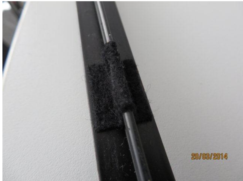
Figure 3: Fleece tape section applied.