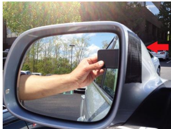
Figure 2. Tape applied over the lane change assist lens.