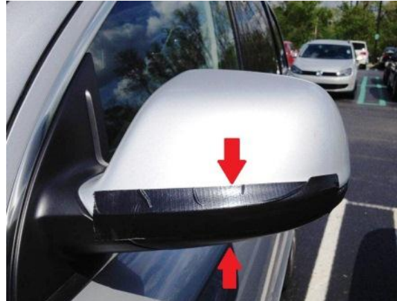
Figure 1. Tape applied to horizontal seam.