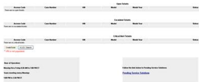
Figure 2. Technical Assistance page