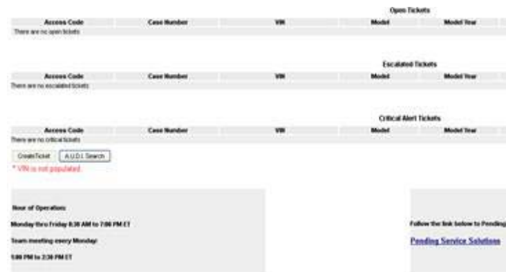
Figure 2. Technical Assistance page