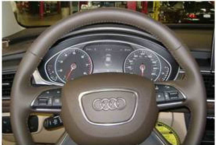
Figure 3. Example of a steering wheel not leveled (off-center) condition.