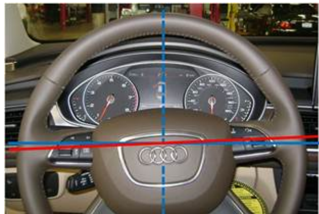
Figure 1. Steering wheel not leveled (off-center)

Tip: If the alignment concern is due to outside influence (e.g. accident), this TSB does not apply.