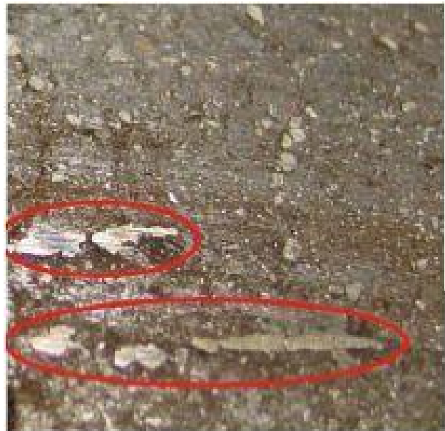
Figure 1. Metallic deposits.