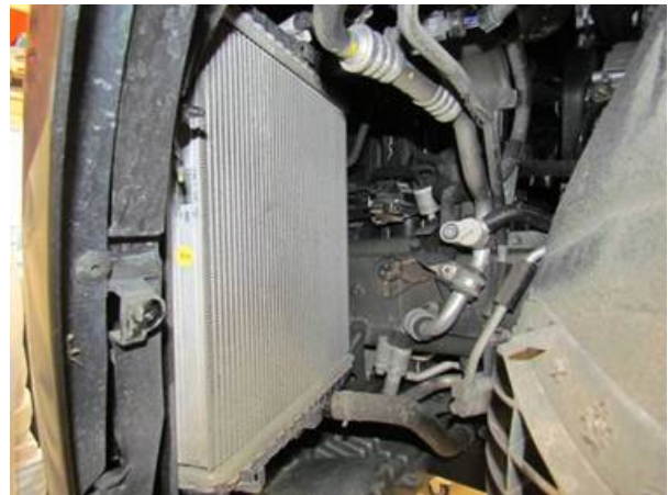
Figure 6. View of charge air cooler with wheel well liner removed.