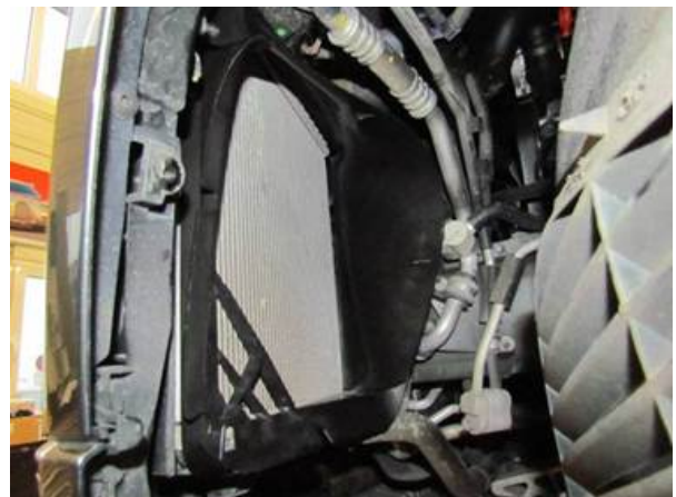
Figure 9. Charge air cooler exit air duct installed.