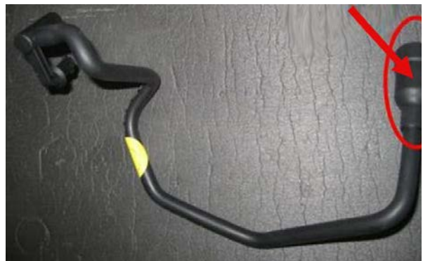
Figure 2. Updated ventilation hose with integrated filter.

Tip: The updated ventilation hose can be recognized by the integrated filter (Figure 2, arrow).