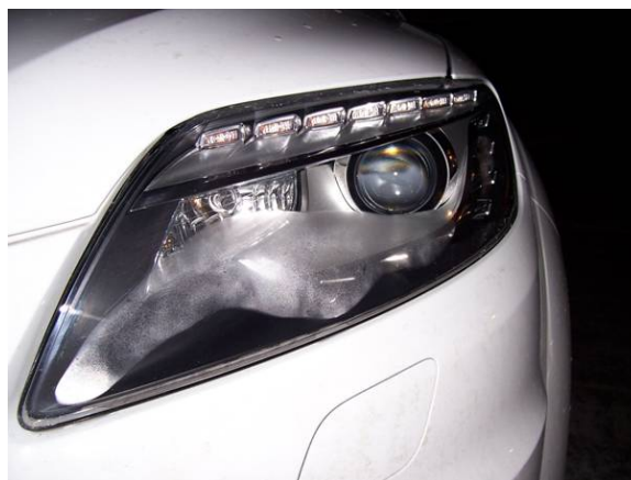
Figure 1. Moisture in headlamp.