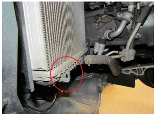
Figure 7. Lower exit air duct attachment point to charge air cooler.