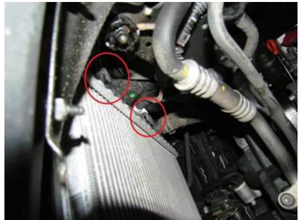
Figure 8. Upper exit air duct attachment points to charge a cooler.