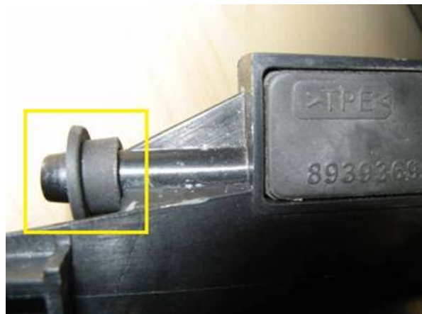
Figure 5. Ring seal installed on headlamp air tube.