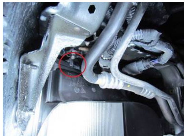
Figure 10. View of exit air duct affixed to mounting hook.