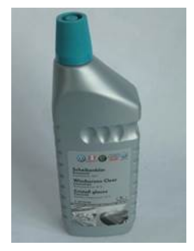
Figure 2: G 052 164 M2 windshield cleaner concentrate with anti-freeze

2. Refill the reservoir with the correct type and concentration of solvent. Windshield cleaner concentrate with antifreeze G 052 164 M2 works best (Figure 2). This solvent can be adjusted for freeze protection to -70° C (-94° F), prevents washer jet contamination particularly on the "fan" type of washer jet, and is highly effective in removing residues and insects from the windshield.