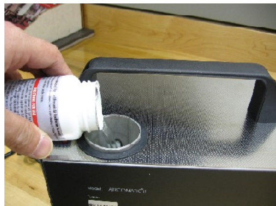
Figure 2. Pouring the treatment into the filling chamber.