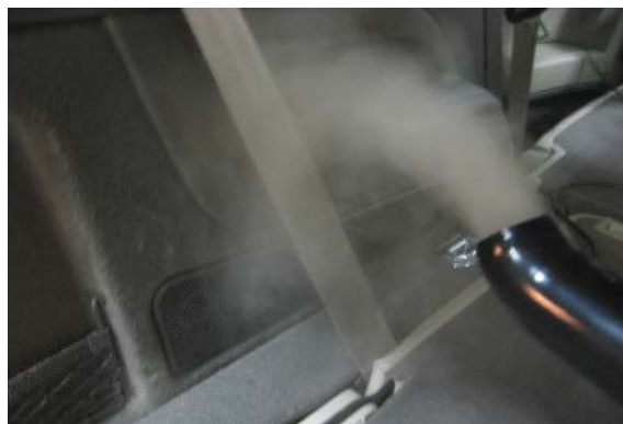
Figure 5. Correct positioning of the outlet tube.