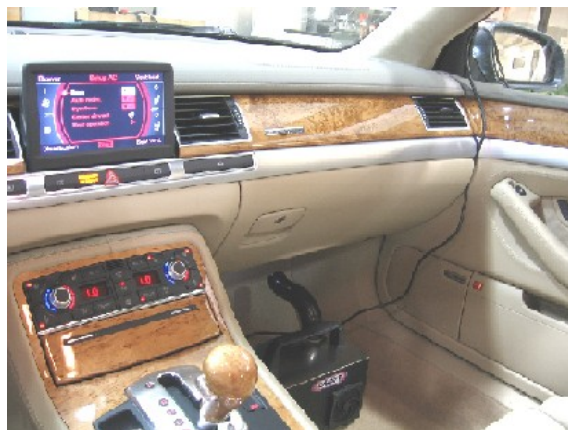
Figure 4. Window is slightly open so that the cord can pass through.