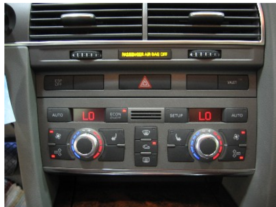
Figure 1. Climate control settings.