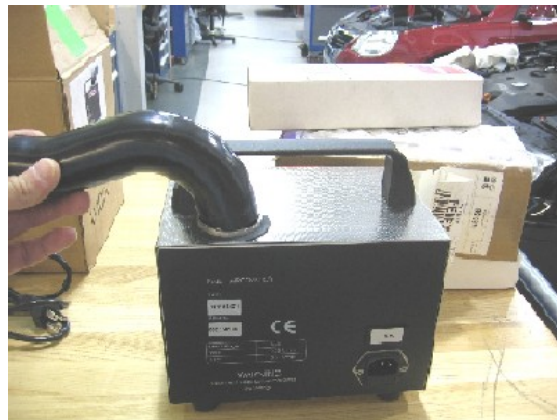
Figure 3. The connected outlet tube.