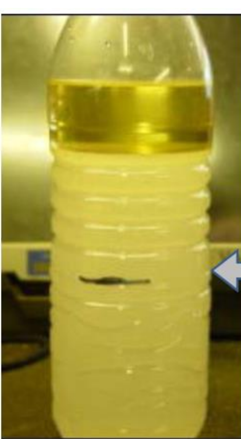
Note that the solution is approx. 80/20 and is foggy. This is an example of E85