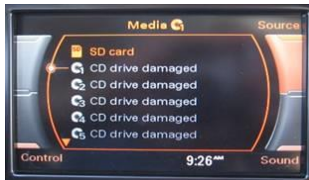
Figure 3. CD drive is not available in the Source selection screen.