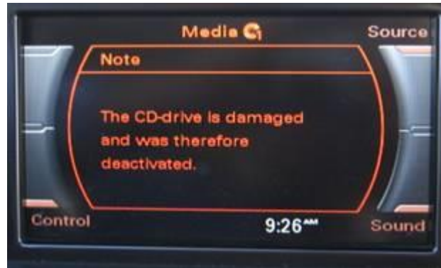
Figure 2. The “damaged CD drive” error message.