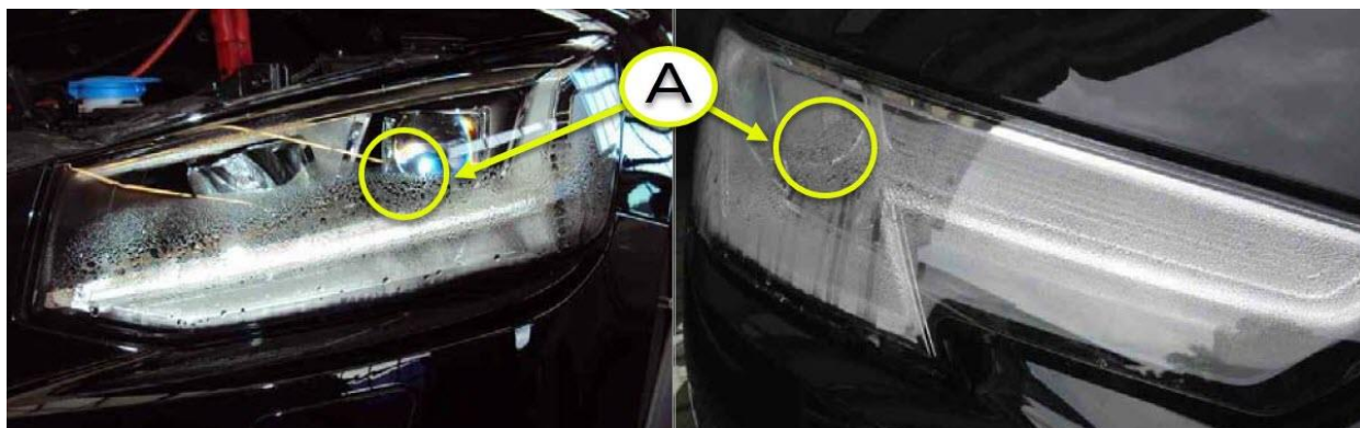
Figure 3. A: main beam light emission surface.