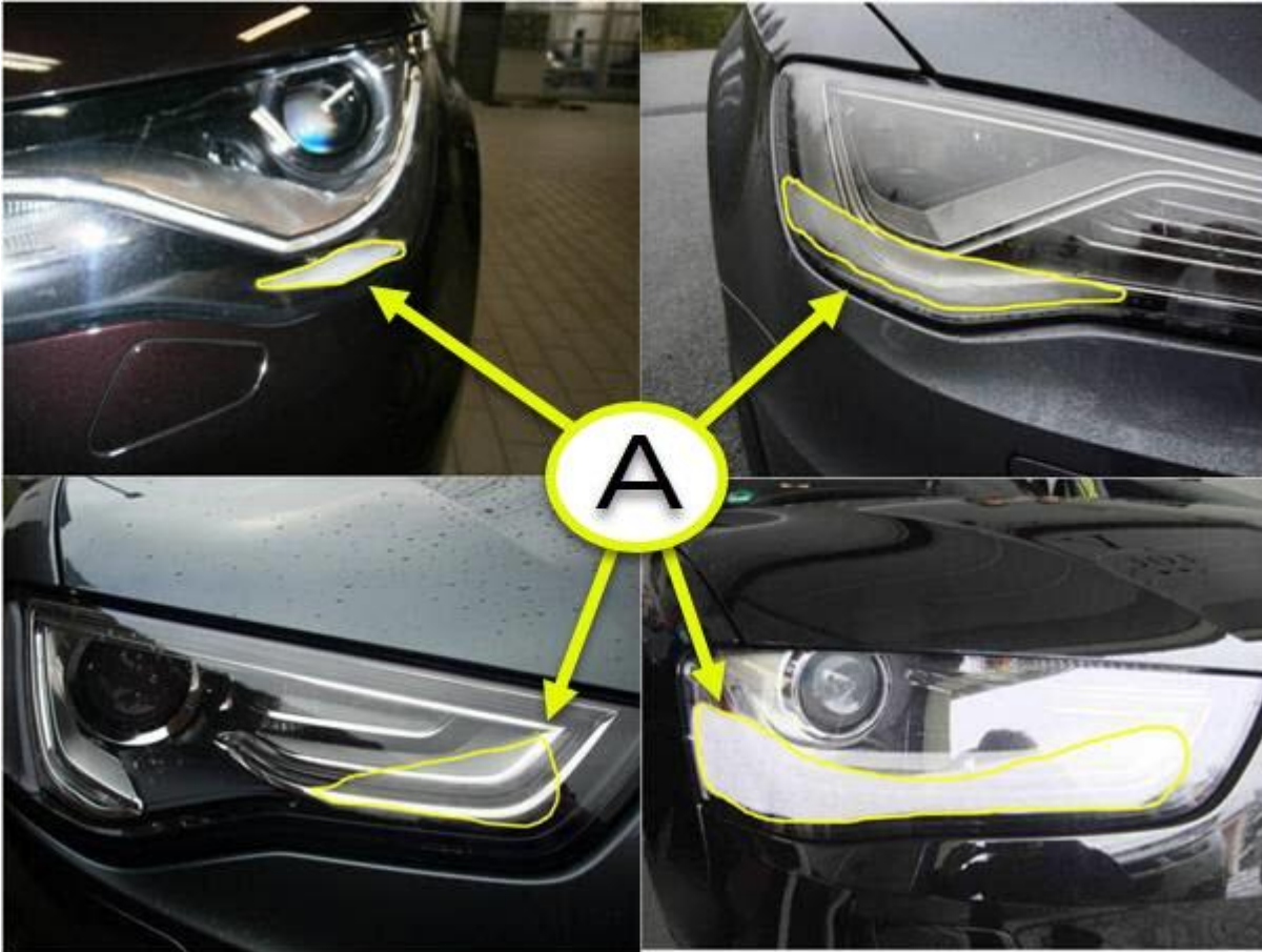
Figure 1. Condensation on the inside of the lights.