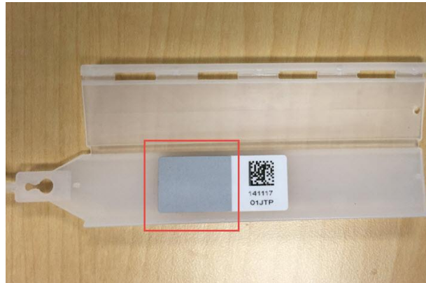
Figure 4. Vehicle code (F-PIN)