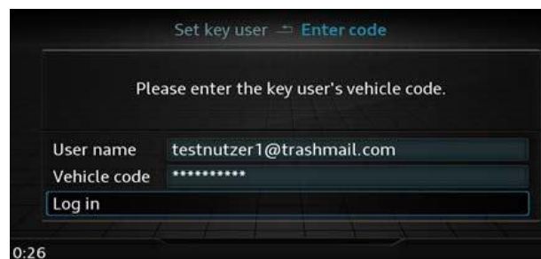
Figure 5. Log in.