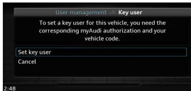
Figure 3. Set key user.