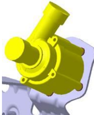
Figure 2. Pump mounted.

Bleed the coolant circuit according to ElsaPro at Repair Manual >> Engine >> 19 Cooling System >> Cooling System/Coolant >> Cooling, Draining and Filling.