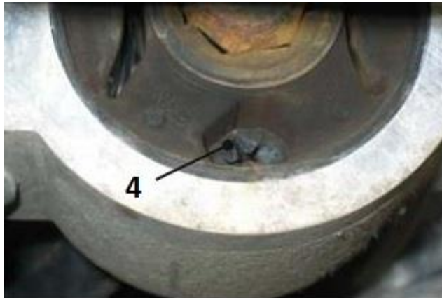
Figure 2. Harmless cracked rubber skins.