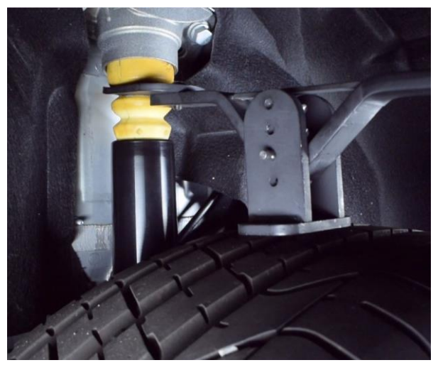
Figure 2. The SET900 tool being used to install a rear bump stop.

The purpose of the tool is to properly seat the rear bump stops in the rear shock mounts (Figure 3), which will prevent them from dropping out of the rear upper shock mounts and causing noise.