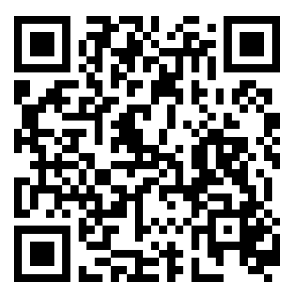
Figure 4. QR code for viewing the video with a QR code reader on phones and tablets. Alternatively, the video can be accessed through computer internet browsers at the link provided in this bulletin.