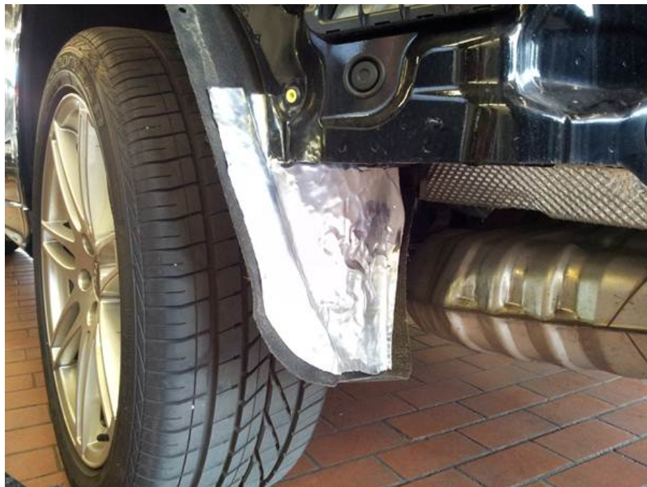
Figure 1. Foil kit installation.