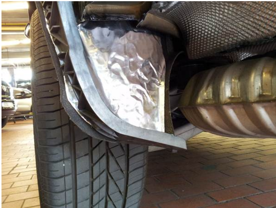
Figure 3. Foil kit installation.