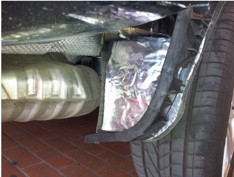
Figure 4. Foil kit installation.