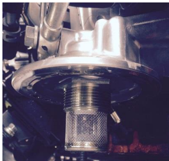
Figure 1 – Secondary Screen