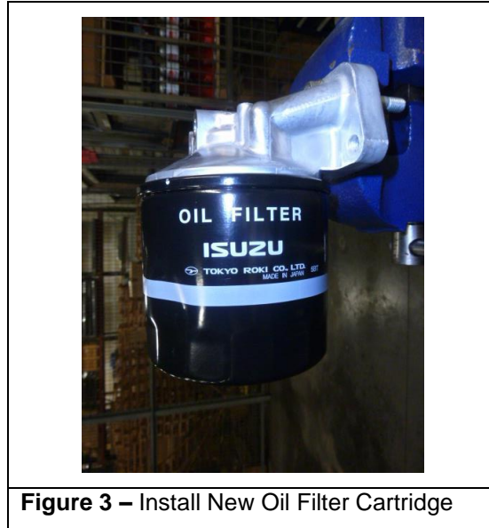
Figure 3 – Install New Oil Filter Cartridge